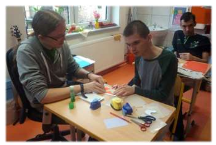
Secondary school in Český Těšín

Kindergarden is attended by children aged 2 – 7 with mental disabilities, autism spectrum disorders, communication and speech impairments, physical disabilities, multiple disabilities and other impairments. There are 6 – 10 children within the class.