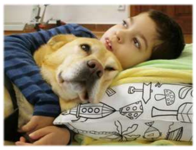
Primary school in Ostrava

activities, art lessons, dressing trainings, walks, locomotor skills games, working with interactive board, working on PC, singing, listening to relaxation music, you will help pupils to play musical instruments. You will have an opportunity to work with educational tools adapted for children with limited fine motor skills.