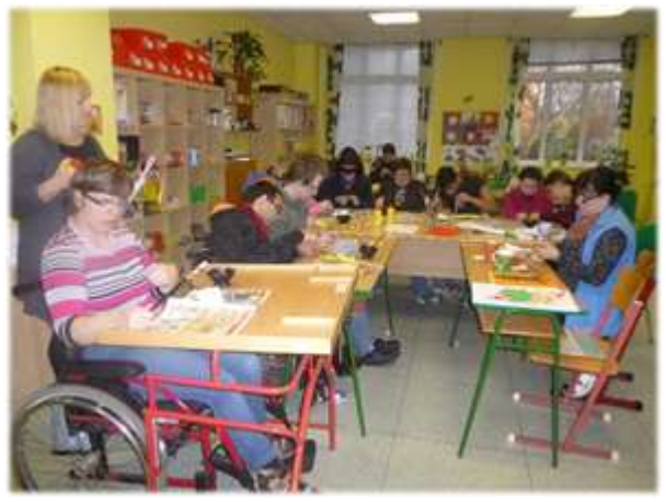
Secondary school in Bohumín

activities, art lessons, dressing trainings, walks, locomotor skills games, working with interactive board, working on PC, singing, listening to relaxation music, you will help pupils to play musical instruments. You will have an opportunity to work with educational tools adapted for children with limited fine motor skills.