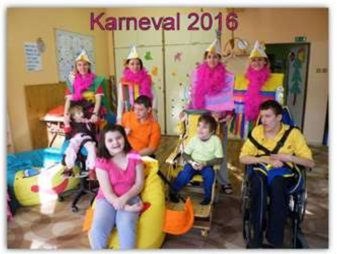
Primary school in Bohumín

They are mostly communicative and active. Task of the teacher is to find out which kind of education will be best for every child.